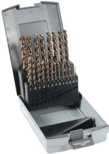
Black & Gold jobber length drill set 228850RO shown