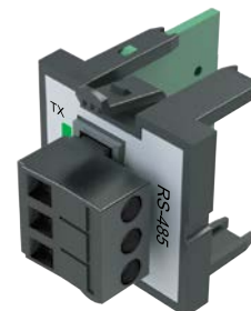
Removable Connector Included

as well as devices that send or receive non-sequenced ASCII strings or characters.