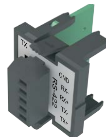
Removable Connector Included

PLCs via K-Sequence protocol, as well as devices that send or receive non-sequenced ASCII strings or characters.