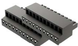
BX-RTB10-2 (Kit - 2 pieces)