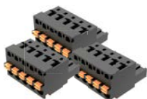
BX-RTB08-1 (Kit - 3 pieces)