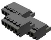
BX-RTB08-2 (Kit - 3 pieces)