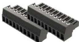
BX-RTB10 (Kit - 2 pieces)