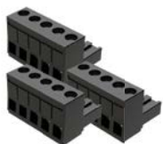
BX-RTB08 (Kit - 3 pieces)