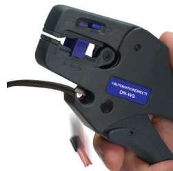
DN-WS wire cutting