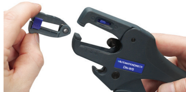
DN-WS stripping blade replacement