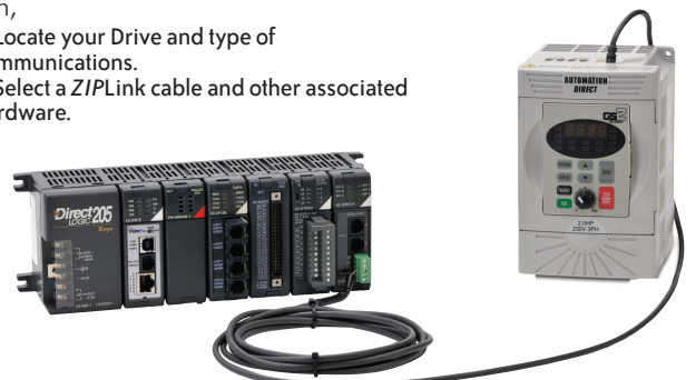
Do-more H2 PLCs