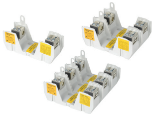
Class J Power Distribution Blocks