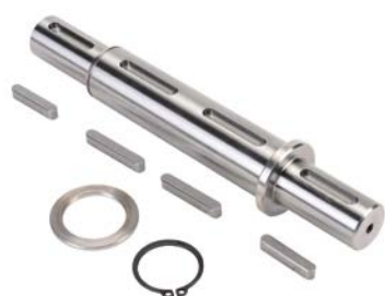
HBR-37-DS Double Output Shaft