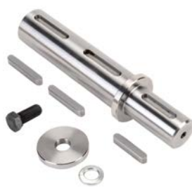
HBR-37-S Single Output Shaft