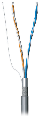
2 Twisted Pairs