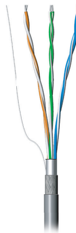
3 Twisted Pairs