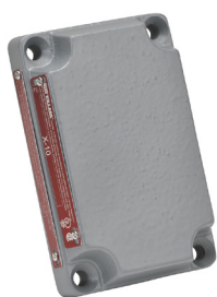
X-10 Blank Cover