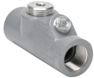
ENY-2 Sealing Fitting

The purpose of seals in a Class I hazardous location is to minimize the passage of gases and vapors and prevent the passage of flames from one electrical installation to another through the conduit system. Consult the electrical code or your local inspector for more detailed information.