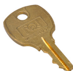
KEY-C002B Replacement Key