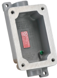
FXB-5 Feed Through