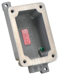
FXB-2 Dead End