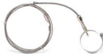
Shown with optional adjustable immersion sensor