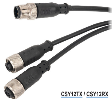
CSY12TX / CSY12RX

When four M5 muting sensors are installed with a ReeR Safegate light curtain, CSY12TX and CSY12RX Y-splitters will be required.