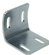
SFB-4SG / SFB-6SG