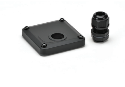
Power Back Cover w/ Cable Gland Part No. MD-PWR-COV