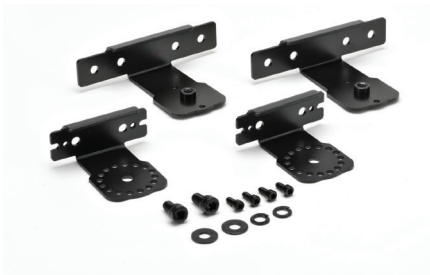
Wall Mount Bracket Part No. MD-BRK-1