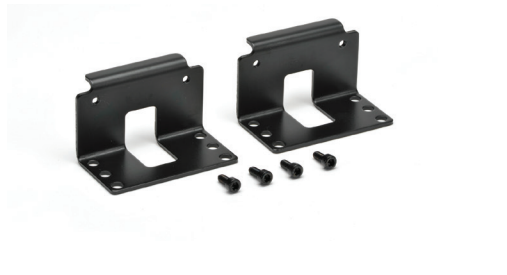
Chain Mount Brackets Part No. MD-BRK-2