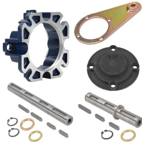
IronHorse Aluminum Worm Gearbox Accessories