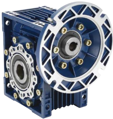
IronHorse Aluminum Hollow Bore Worm Gearbox